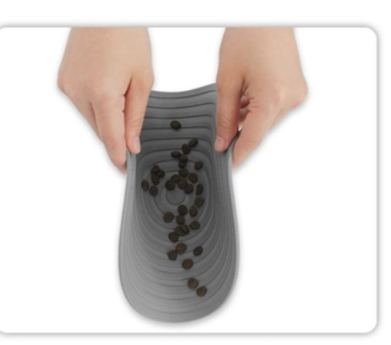
② Pick up both sides of the food mat to avoid spillage