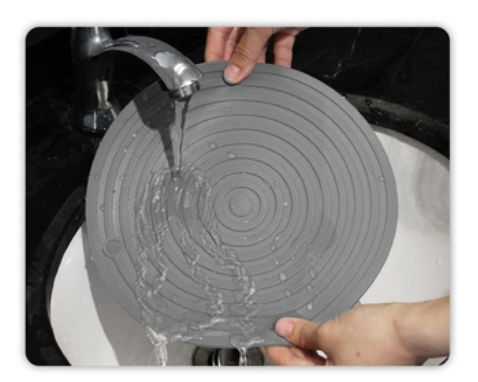
③ Rinse off with water