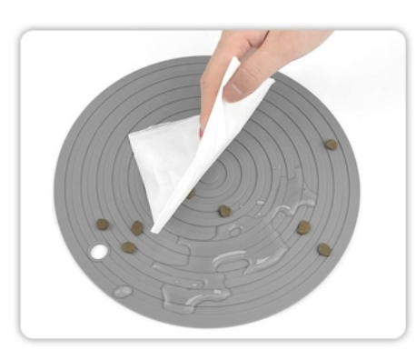
① Wipe with a dry towel