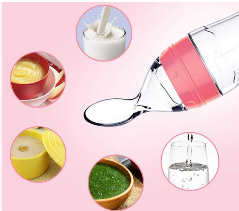
ALL-IN-ONE PINK SPOON FEEDER FOOD GRADE SILICONE & 4OZ/120ML