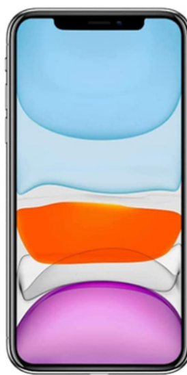
iPhone 13 pro