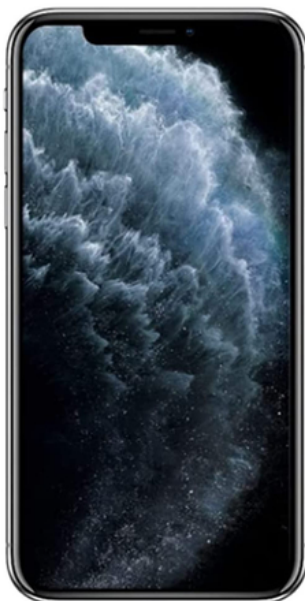
iPhone 13 pro max