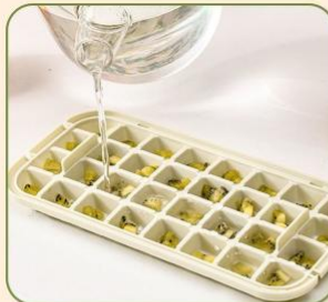
Ice storage Bin

Fill the ice maker tray with water or liquid to be frozen.