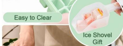
Ice Shovel Gift