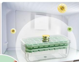
Sealed without Odor