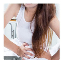
Warm menstrual period