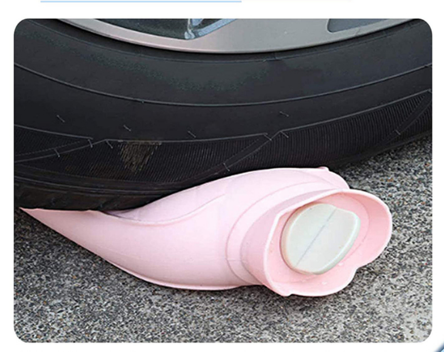
Made of high quality silicone and pc and pa material, not easy to aging odorless , explosion-proof and durable.