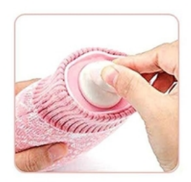
3. Exhaust excess air, turn the cover tightly